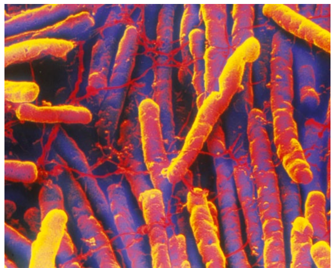
Figure 1: Clostridium difficile

Modulating gut bacteria with short-term antibiotic treatment has been shown to lead to temporary improvement in behavioural symptoms in some individuals with ASD 4 . It is however unlikely that the cause of the intestinal disturbance in autistic children is due solely to one pathogen but rather a disturbance of the individual's entire gut ecology and a reduction in the protective microflora. It is of concern to some that a significant percentage of individuals with autism have a history of extensive antibiotic use 11 . Oral antibiotics are now well known to significantly disrupt protective intestinal microbiota, creating a favourable environment for colonization by opportunistic pathogens 11,12,13 such as Clostridium difficile and Desulfovibrio 14 .