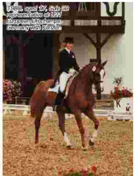
1980, aged 17, Sale GB representative at U21 European U18 champs Germany with Kanzler.

Many thanks to Equestrian Lifestyle magazine for their interest.