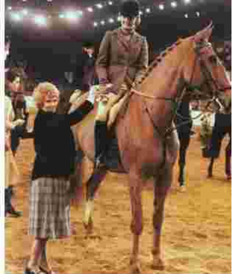
Overall champion at HOYS with Lord Richard in 1980, aged 17.