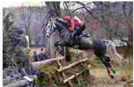
In 1976, aged 13 on Stahlberg, a few months before the 'big fall' off another horse that had the heart attack. One of the last times I was physically able to do X Country!